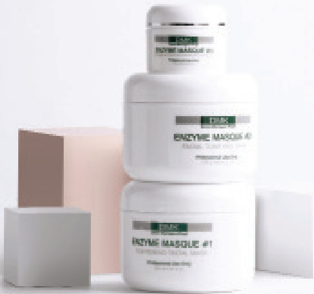
Rebuilding skin, rebuilding lives

Leave feeling younger with DMK's long-lasting answer to Botox.